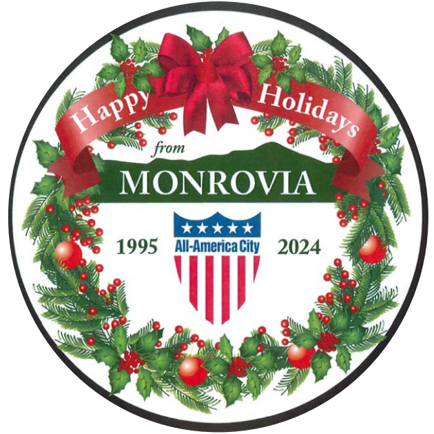
Design No. 6