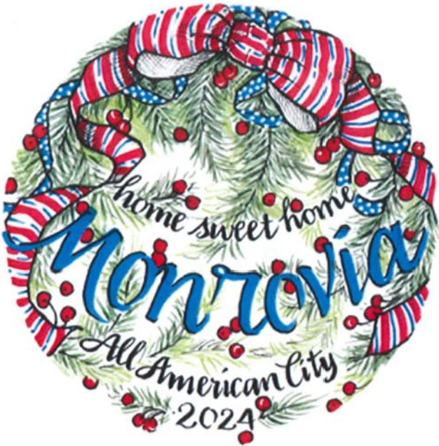
Design No. 7