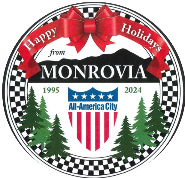
Design No. 1