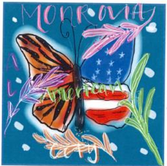
Design No. 3