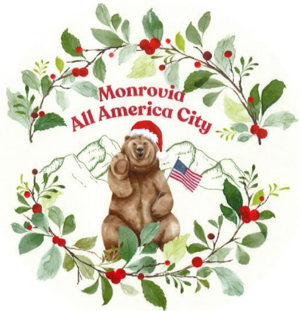
Design No. 2