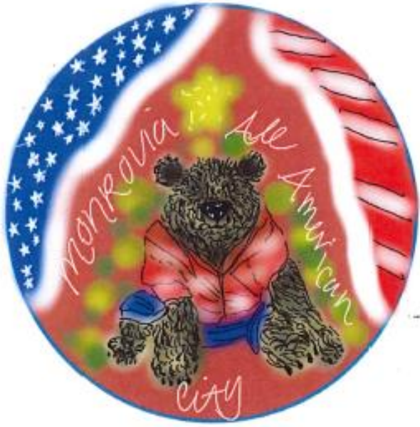
Design No. 5