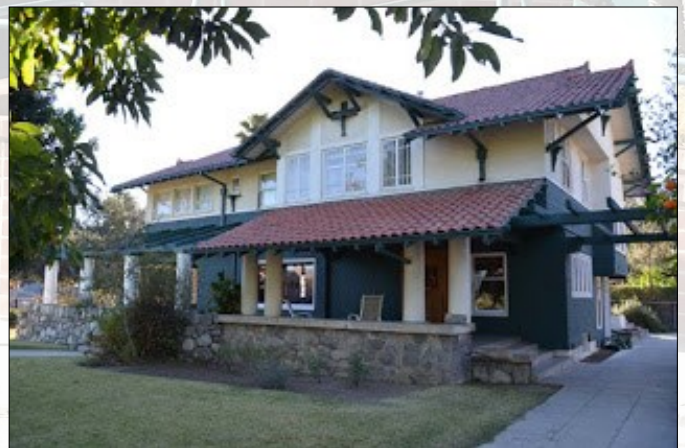
Historic Landmark No. 1 — 231 North Primrose Avenue