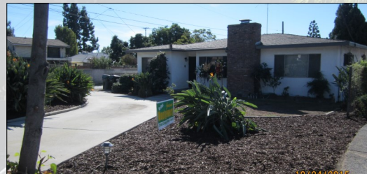
Former Mayor Bartlett's Front yard After