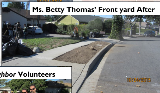
Care for Your Neighbor Volunteers