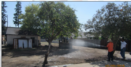
Former Mayor Bartlett's Backyard After