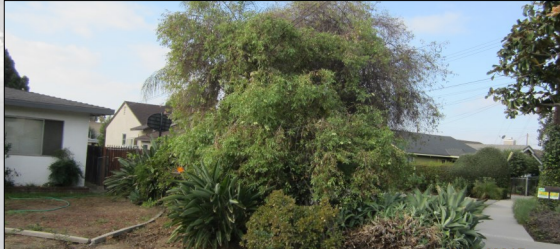
Former Mayor Bartlett's Front yard Before