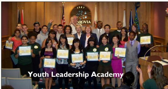
Youth Leadership Academy