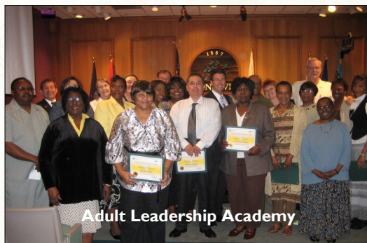
Adult Leadership Academy