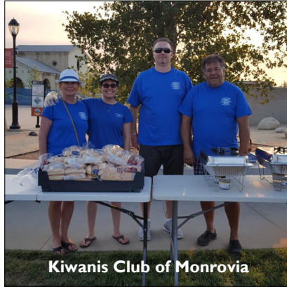
Kiwanis Club of Monrovia