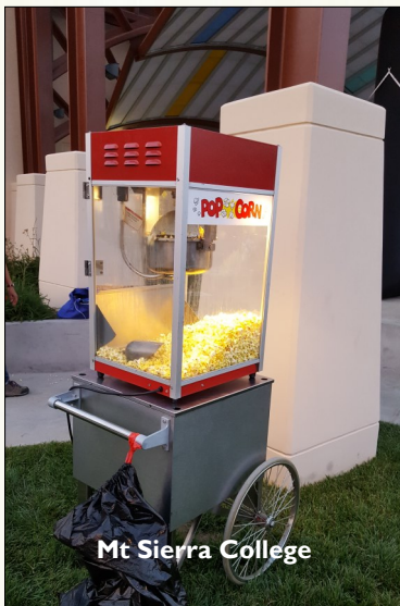
Mt Sierra College

Thank you all so much for coming out and bringing your families to our Summer Movie Series! This summer, we played four movies around the City (Ant Man, Hotel Transylvania 2, Star Wars: The Force Awakens and Good Dinosaur), reaching out to various neighborhoods. We had so much fun with the snacks, raffles and family time!