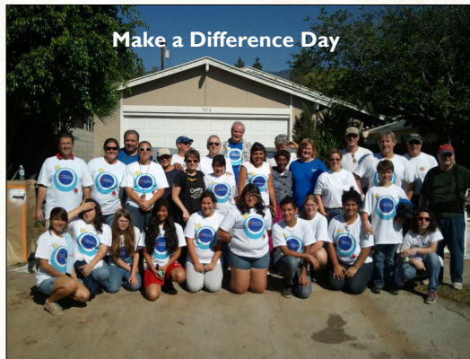
Make a Difference Day

MAP was initiated in 2006 in an effort to decrease crime, blight and resident apathy by encouraging civic engagement. MAP threw block parties, affectionately known as "Hot Dogs, Hot Links and Hot Topics", in various neighborhoods to allow residents to safely and comfortably meet with City Staff and their neighbors. Feedback from those block parties helped to form the MAP program into the citywide program and philosophy that we have today of Partnering Together for a Better Monrovia .