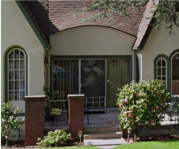
Front Porch Repair/Restoration