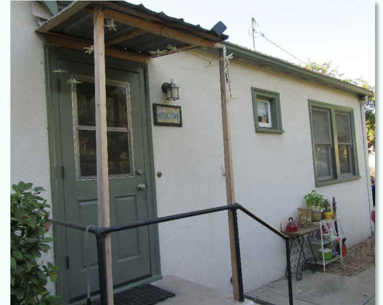
Replace Kitchen Door and Patio Cover