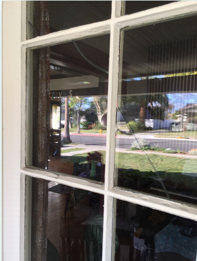
Repair Window Glass