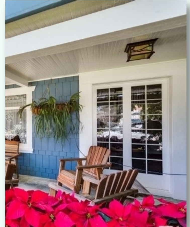
Repair French Doors