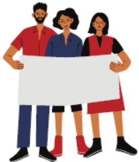
Community Services Commission