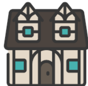
Historic Preservation Commission