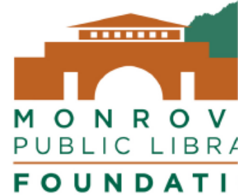
Monrovia Library Foundation