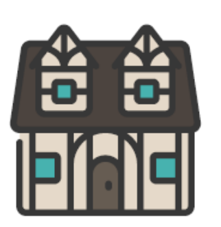
Historic Preservation Commission