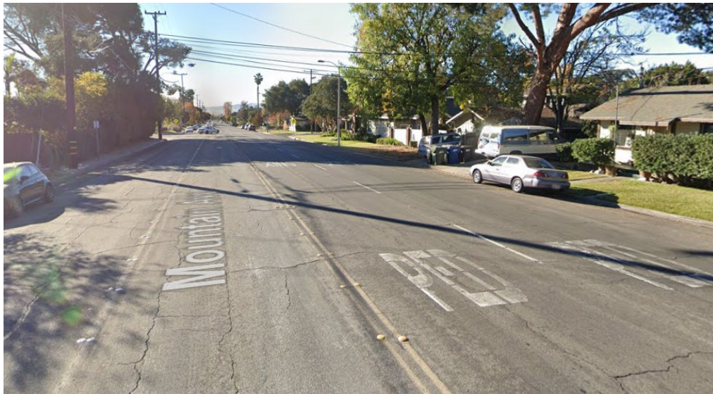
Foothill – Southbound