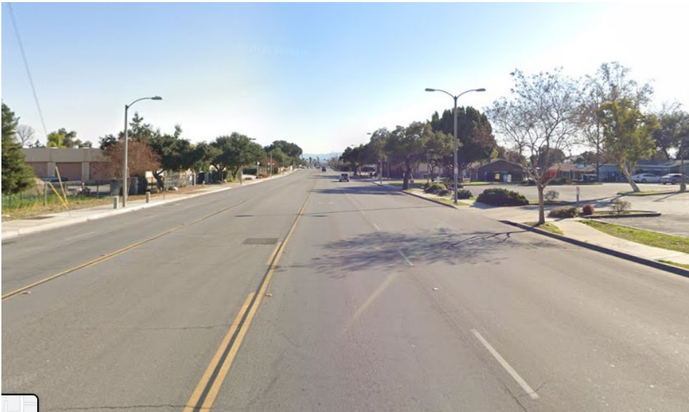
Lemon Ave - Southbound