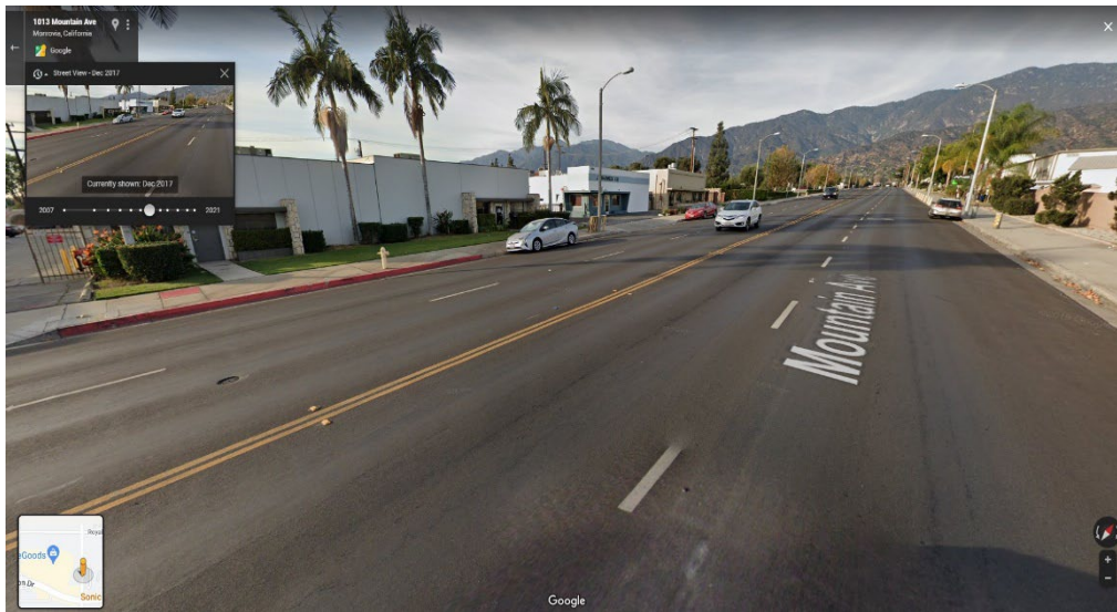
Huntington Drive - Northbound