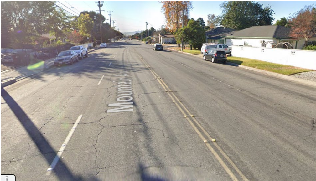
Oakdale – Southbound