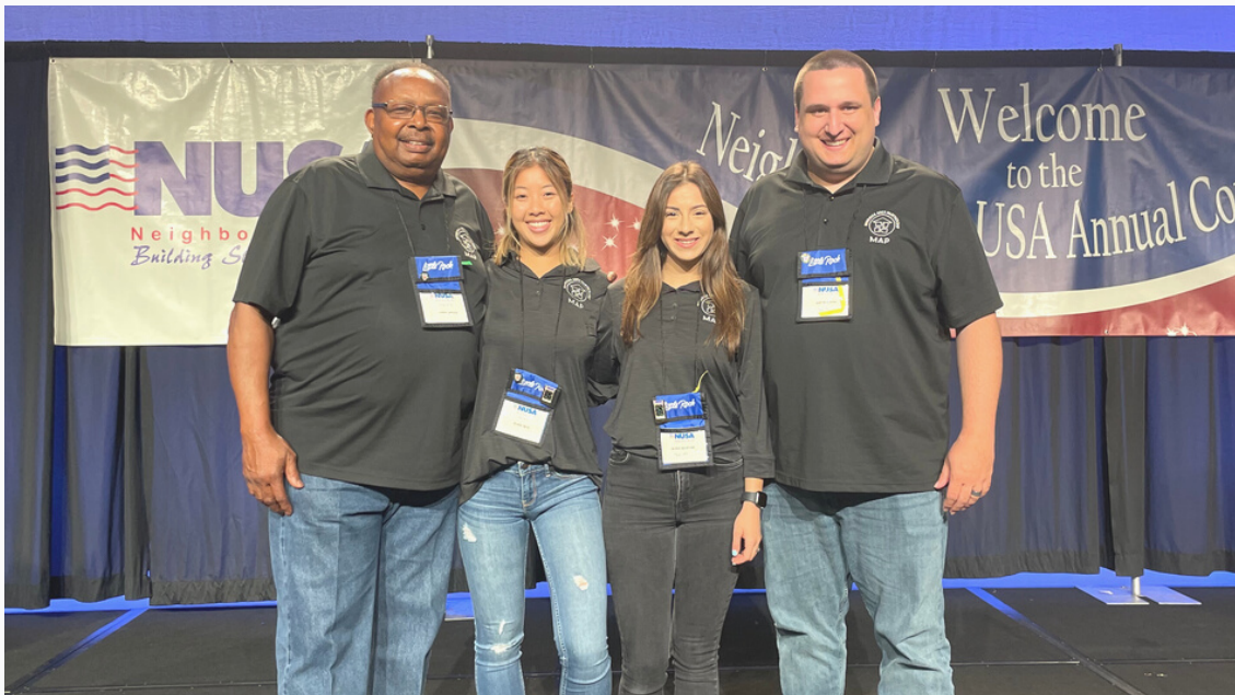
Monrovia Area Partnership Best Neighborhood Program Award Finalist

for the Best Neighborhood Program award for our virtual MAP Neighborhood Conference that took place in 2021! The MAP team presented to a panel of judges on our 11th Annual VIRTUAL MAP Neighborhood Conference in hopes to inspire other cities and organizations, and to show how our team adapted in the heat of the pandemic. We attend the NUSA Conference yearly in hopes to learn about the various events and programs that other cities in other states have, so that we can implement new ideas to make our MAP programs and events better for our community. Fun fact, most of MAP's current programs and events came from previous NUSA Conferences. :)