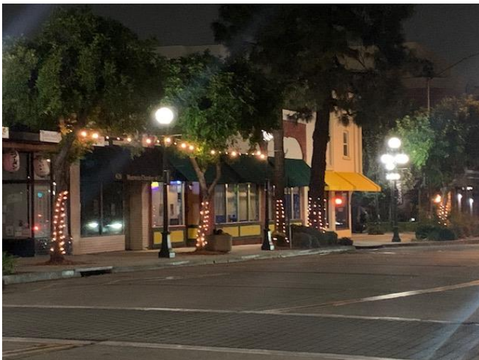
Existing Tree Lights

If the Board approves, staff will present the recommendation to City Council for consideration.