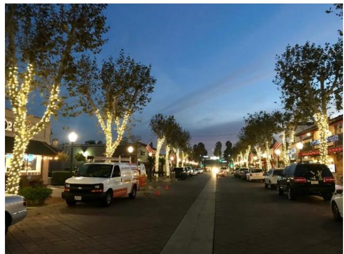
Sample of Similar Trees