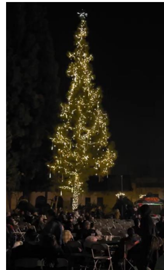
Lights on a Similar Tree La Verne