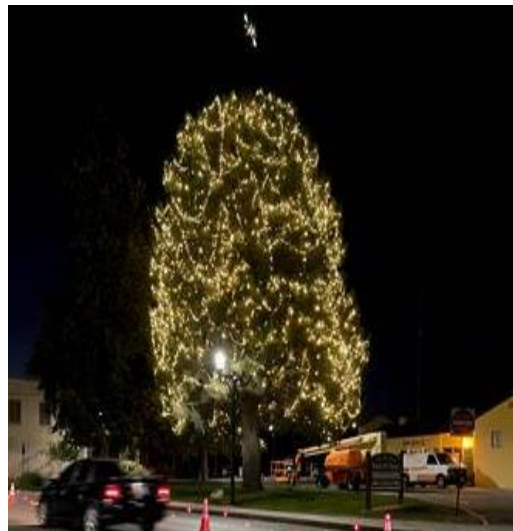
Lights on a Similar Tree San Dimas