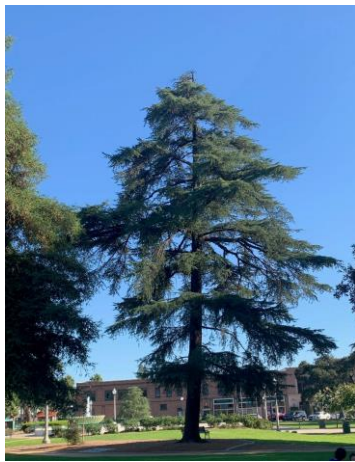
Recommended Deodar Cedar Looking South

While staff is recommending a new Holiday Tree be lit as a part of the annual celebration, the existing Willow Pine, which was donated in 2013, will also be lit with enhance warm white LED lights. The cost is $2,111 and is included in the FY 23/24 operating budget.