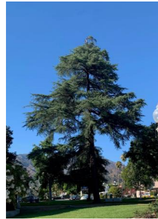
Recommended Deodar Cedar Looking Northeast