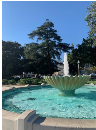
Recommended Deodar Cedar Looking Northwest