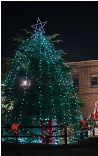
Current Holiday Tree