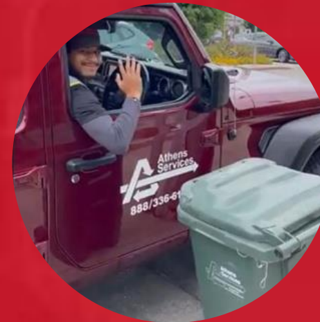
1. Driver sits on the right-hand of the vehicle