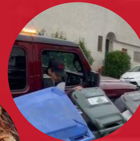
2. Flips the lid of the container