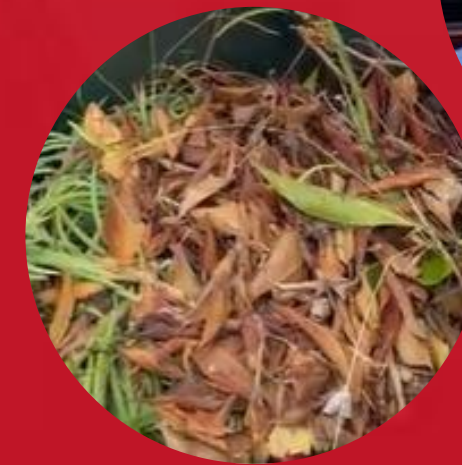
3. Checks for contamination