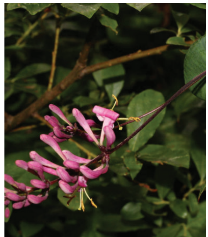
CALIFORNIA HONEYSUCKLE Lonicera hispidula