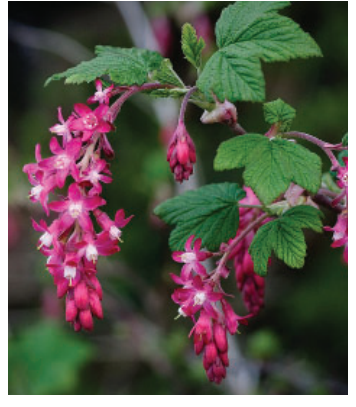
EVERGREEN CURRANT Ribes sanguineum