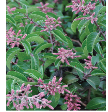
SUGAR BUSH Rhus ovata