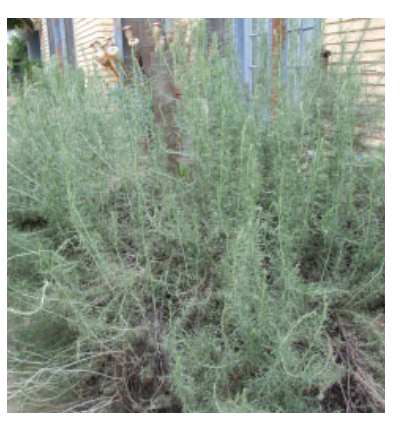
MANZANITA CALIFORNIA SAGEBRUSH Arctostaphylos 'Dr Hurd' Artemisia californica