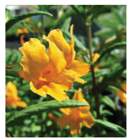
STICKY MONKEYELOWER Mimulus aurantiacus