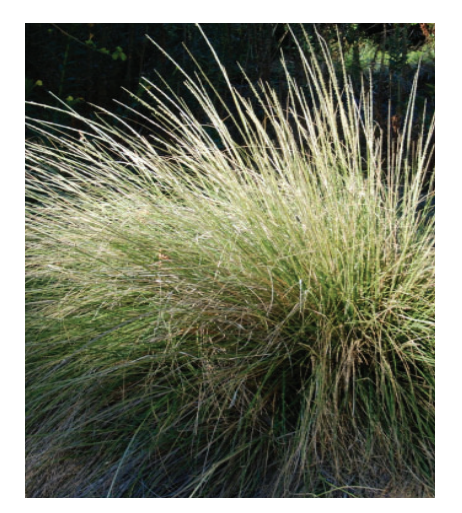
DEER GRASS Muhlenbergia rigens