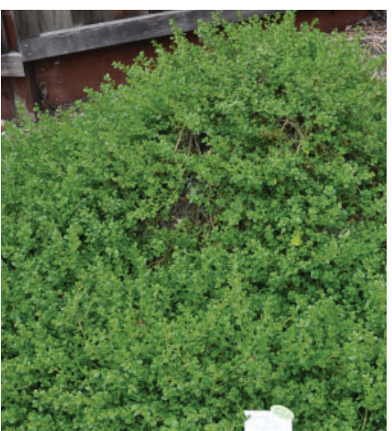
COYOTE BRUSH Baccharis pilularis