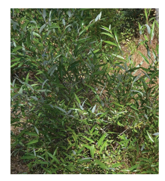
RED WILLOW Salix laevigata