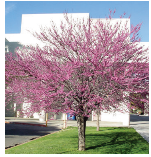
WESTERN REDBUD Cercis occidentalis