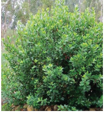
LEMONADE BERRY Rhus integrifolia