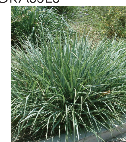
CALIFORNIA WILD RYE Leymus condensatus