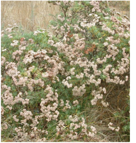
CALIFORNIA BUCKWHEAT Eriogonum fasciculatum