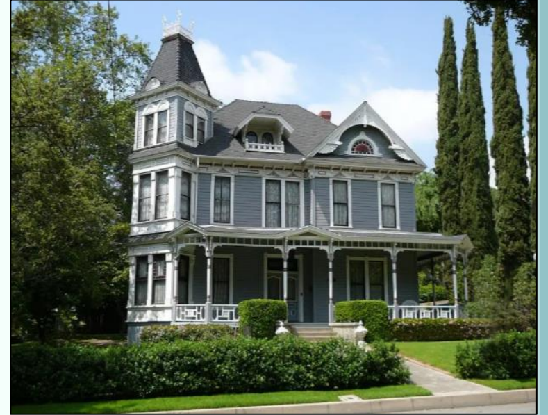
Milton Monroe's House / Mills View HL #2 – Built in 1887