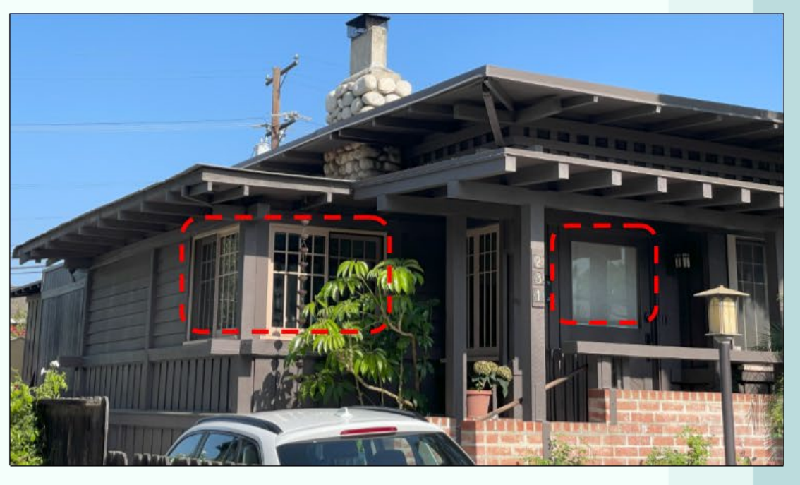
Real Estate Photo - 2010