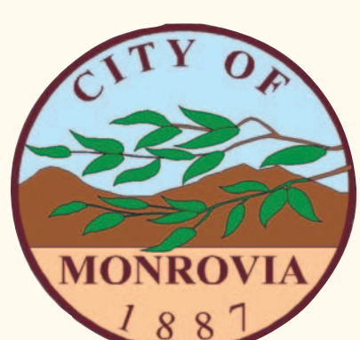
PHOTO OF MONROVIA

The land for the Hillside Wilderness Preserve was purchased with grant funds from these resources: State Wildlife Conservation Board, Governor's Challenge Grant, State Habitat Conservation Fund, Rivers and Mountains Conservancy, Prop 40 - Safe Neighborhood Parks, Clean Water, Clean Air, and the Coastal Protection Bond Act of 2000, Rivers and Mountains Conservancy Prop 12 - Riparian Habitat.